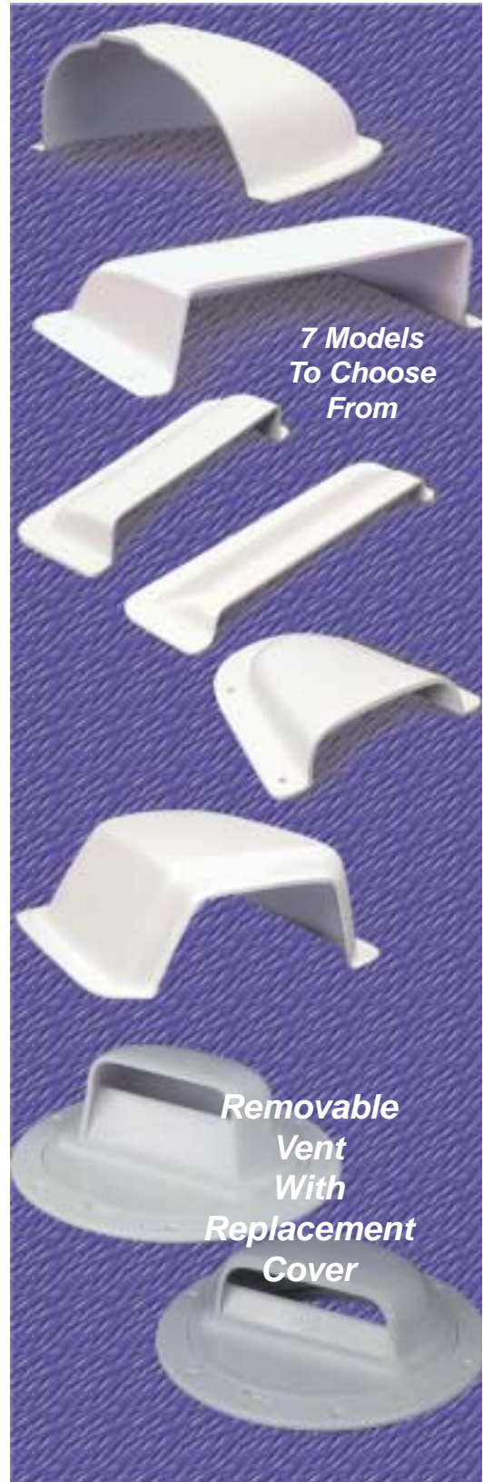
7 Models To Choose From