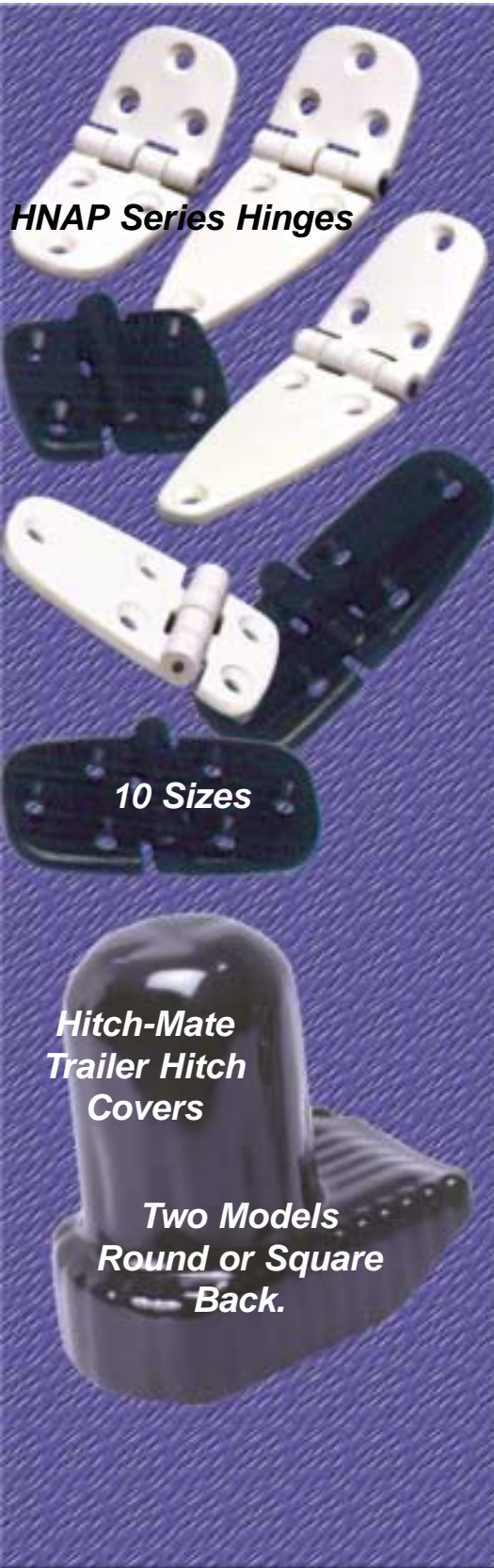
HNAP Series Hinges